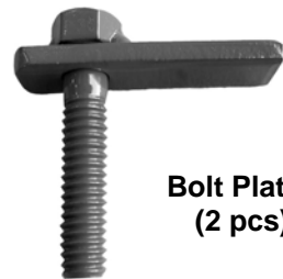
Bolt Plates (2 pcs)