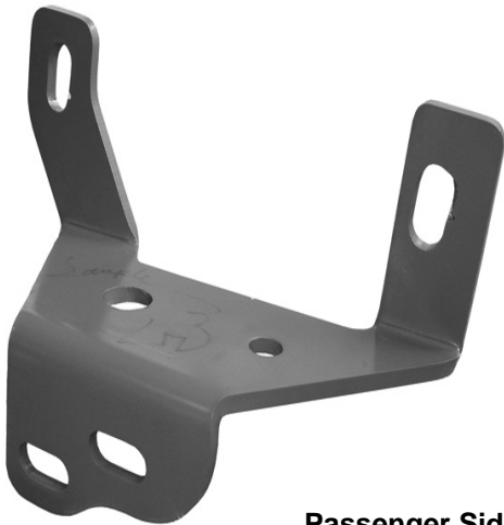
Passenger Side Mounting Bracket