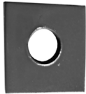
Square Washer (2 pcs)